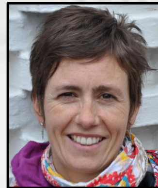
Anik De Groof , Solar Physicist for the European Space Agency (ESA)